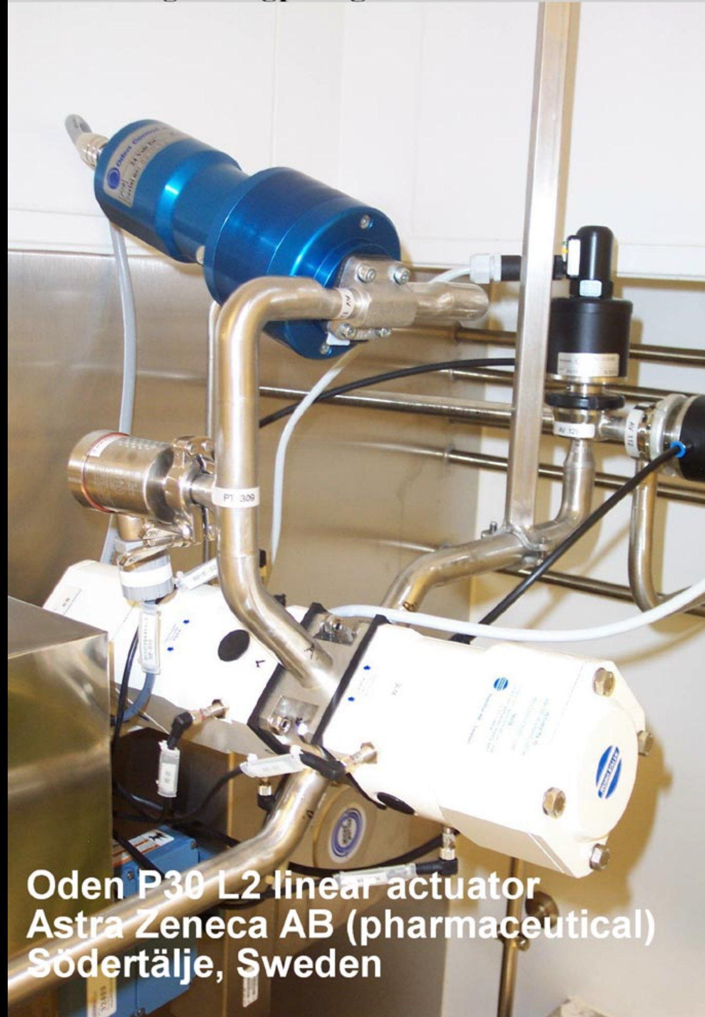
Oden P30 L2 linear actuator Astra Zeneca AB (pharmaceutical) Södertälje, Sweden