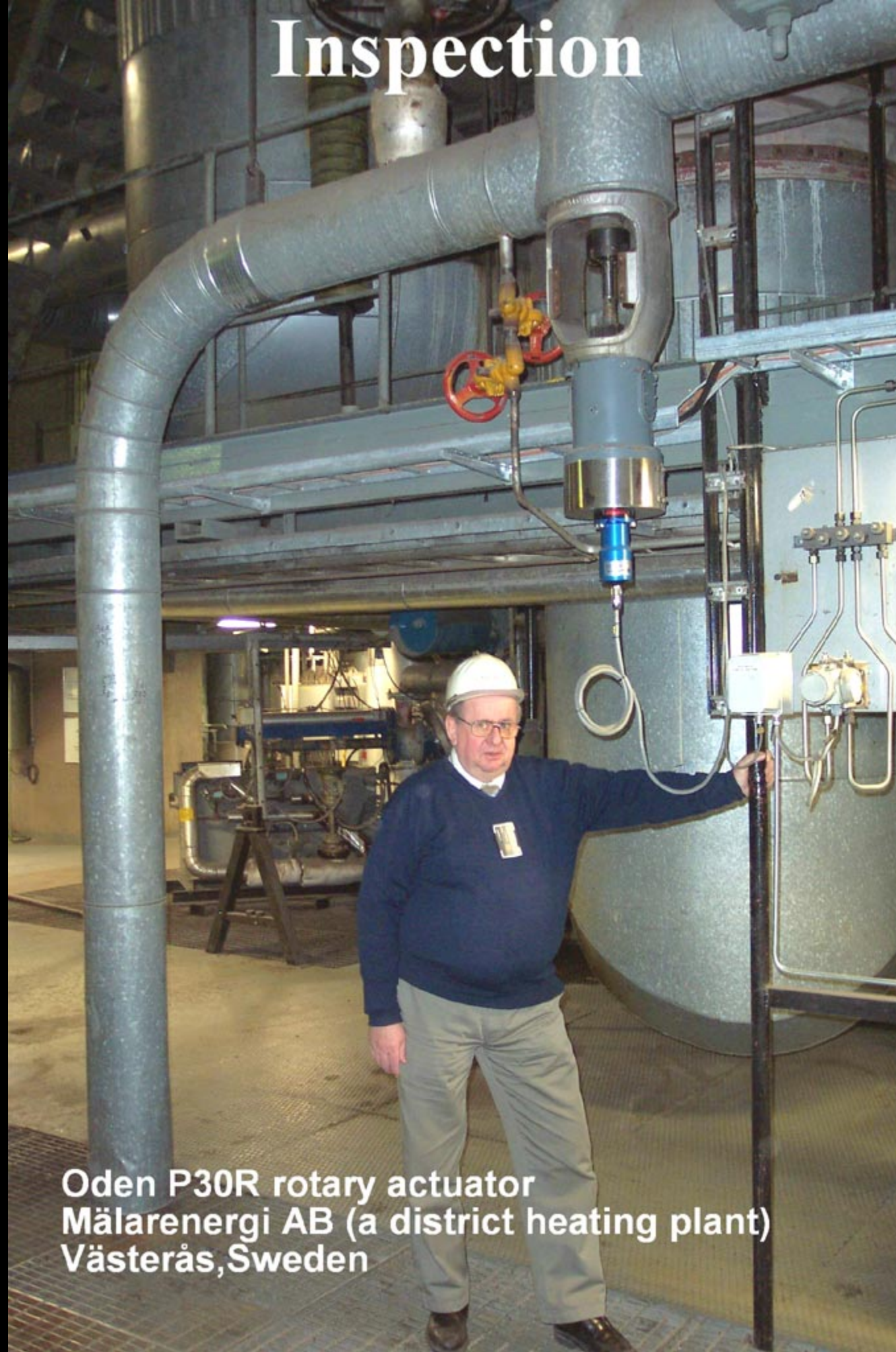
Oden P30R rotary actuator Mälarenergi AB (a district heating plant) Västerås, Sweden